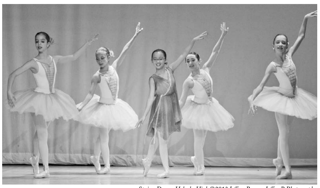
Spring Dance, Holyoke High